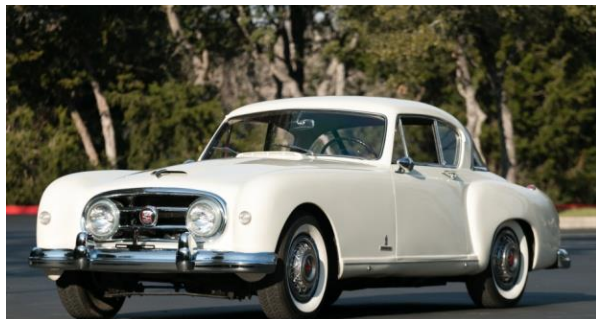
1954 Nash Healey LeMans Coupe