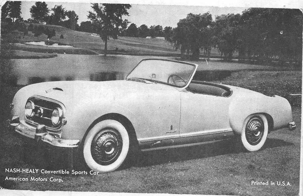
NASH-HEALEY Convertible Sports Car American Motors Corp.